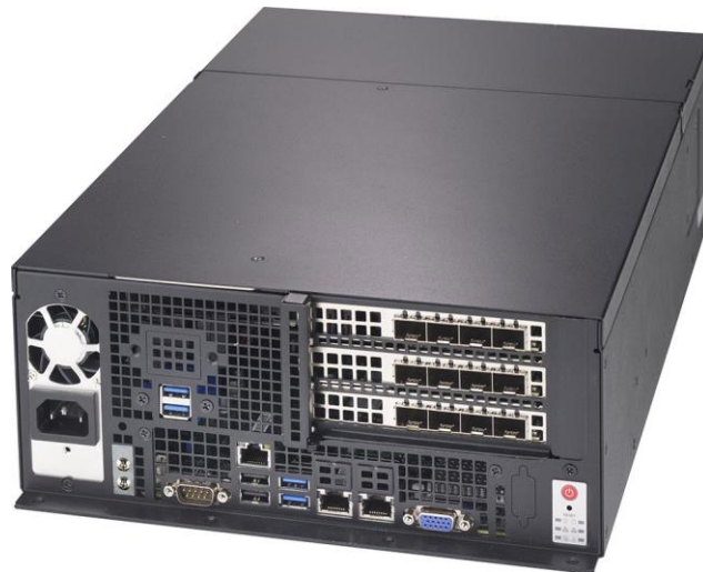
Supermicro E403 Server

This system can house up to three Intel® Data Center GPU Flex 170 cards, giving the Supermicro E403 tremendous AI performance for environments where checkout traffic requires high performance. Each Intel® Data Center GPU Flex 170 contains 16GB of GDDR6 memory and 32 Xe cores.