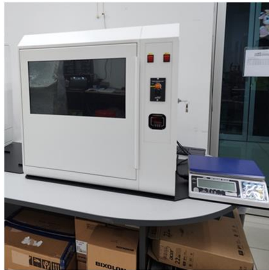
UST Product Box for AI Training

During the training phase, an item is placed in a product-training box, and a 360-degree scan of the product is performed. Within 5 minutes, the scans from the image and other identifying information such as the UPC, current pricing, and additional identifying information are saved.