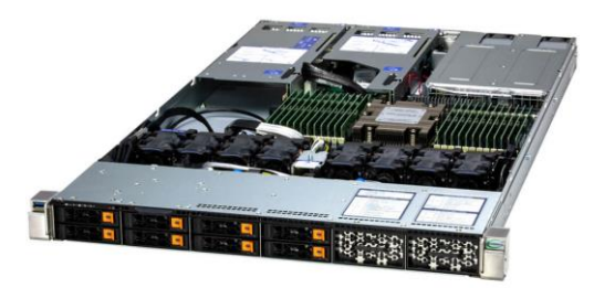
Fig. 3 Hyper A+ Server AS -1115HS-TNR