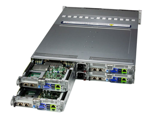
Fig. 3 1. BigTwin SuperServer SYS-621BT-HNC8R