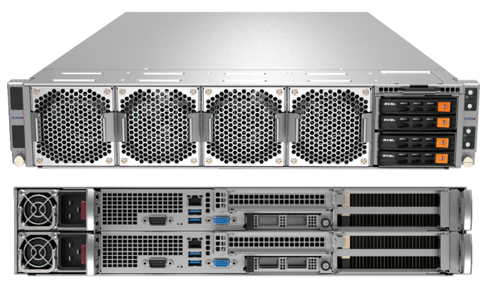
A+ Server 2114GT-DNR

If your workload calls for GPU acceleration, our 2U 2-Node Multi-GPU server combines the computing power of AMD EPYC<sup>™</sup> processors with your choice of up to six double-width or twelve single-width GPUs—all in a dense 2RU form factor.