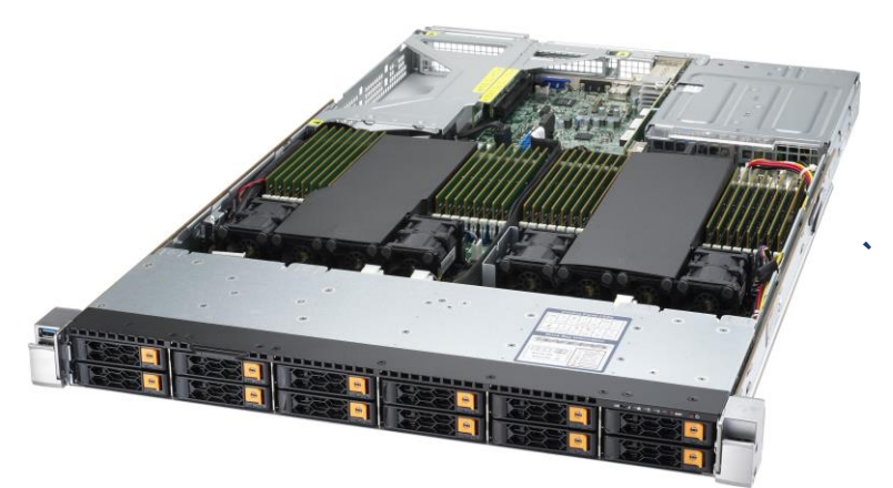
Supermicro AS -1124US-TNRP Server