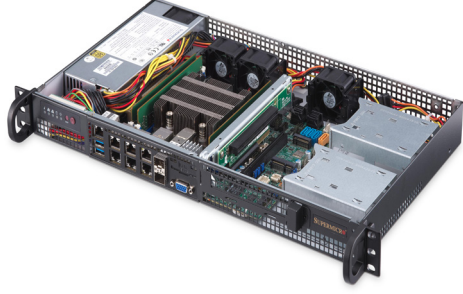
Intel® Select Solutions uCPE Base Configuration SYS-5019D-FN8TP