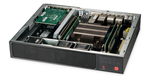
Intel® Select Solutions uCPE Base Configuration SYS-E300-9D-8CN8TP