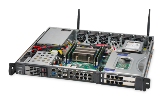
Intel® Select Solutions uCPE Plus Configuration SYS-1019D-16C-FHN13TP

Supermicro's verified Intel Select Solutions for uCPE are designed and tested to enable easy integration with a variety of VNFs, including SD-WAN (software defined-WAN). SD-WAN has its roots in SDN, which is built on the underlying principle of abstracting the network hardware and transport characteristics from the applications