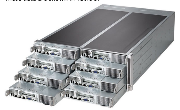
Figure 3: Supermicro FatTwin™ (SYS-F618R3-FTL)

The E5 v4 based FatTwin™ system demonstrated a 26% improvement in performance over the previous generation E5 v3 based system. Performance-per-watt improvement with the E5 v4 based system was 25%. These data are shown in Table 3.