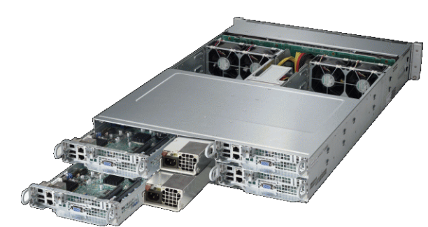
Figure 2: Supermicro TwinPro™ (SYS-2028TP-HTR)

The E5 v4 based 2U TwinPro<sup>2™</sup> system shown in Figure 2 demonstrated a 26% improvement in performance over the identical system configured with previous generation E5 v3 CPUs and memory. Performance-per-watt was also significantly higher at 29% with the new generation system. These data are shown in Table 2.