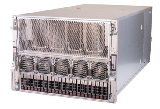
Figure 4 - 8U 8 GPU Server

b. GPU System with PCI-E GPUs – The GPU systems that attach the GPU accelerators via the PCI-E bus are ideal for environments requiring multiple GPUs that perform their work with direct commands from the CPU. HPC and AI/ML environments will benefit significantly from the 4<sup>th</sup> Gen AMD EPYC processors. Various platforms can accommodate from one to 10 GPUs.