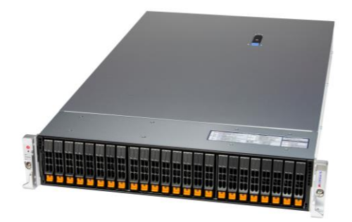
Figure 6 – Hyper Server

Hyper Family - The Hyper servers are designed for maximum rackmount flexibility with rear and front I/O for today's data center requirements as a single or dual socket server. These systems can handle the maximum wattage of CPUs and the maximum number of DIMMs to accelerate a wide range of workloads. In addition, the Hyper systems sport many PCI-E slots (up to eight) for extreme flexibility, are toolless for fast and easy servicing, and come with various storage devices (NVMe/SAS/SATA). The Hyper systems can also support up to 2 AIOM/OCP 3.0 NICs.