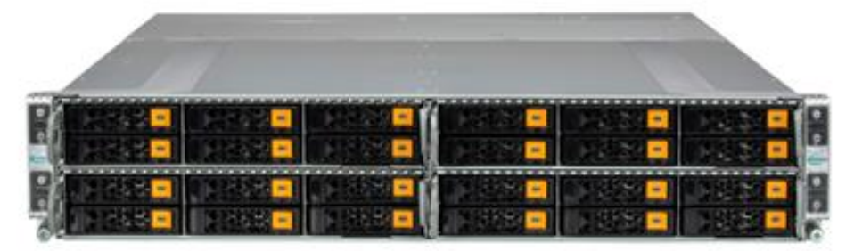
Figure 2 - Supermicro GrandTwin(TM)

Diskless HPC • All-Flash HCI • Hybrid Cloud • All-Flash NVMe Storage • High-Performance File Systems • Software-Defined Storage