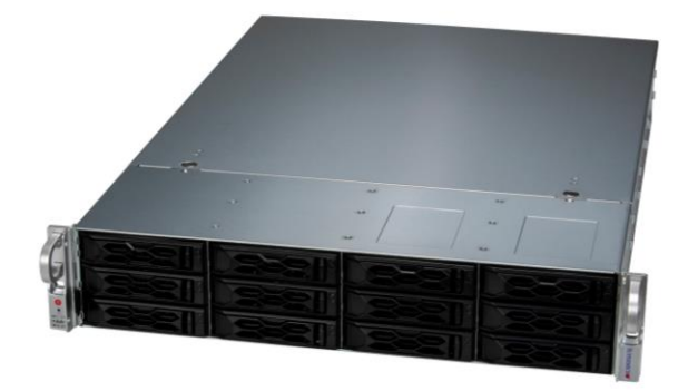
Figure 7 - CloudDC Server

The 4<sup>th</sup> Gen AMD EPYC processor features that would benefit these applications include the increased core count and PCI-E 5.0.