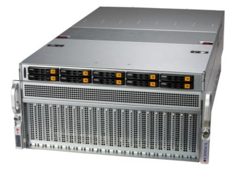
Figure 3 - 5U GPU Server with OAM GPUs

For the Supermicro GPU systems, all of the new features of the 4<sup>th</sup> Gen AMD EPYC processors will help highend applications perform better and return faster with the latest GPU systems from Supermicro. More and faster cores, higher bandwidth to the GPUs and other devices, and the ability to address vast amounts of memory are exactly what large HPC and AI applications demand.