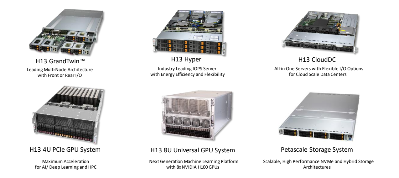
Figure 1 - Supermicro Product Lineup of H13 Systems

The Supermicro AMD product family contains many servers designed for customer workloads. All of the systems take advantage of the new features and capabilities of the 4th Gen AMD processors. The Supermicro product line can be segmented into the following areas. This white paper will look more closely at the following product lines: